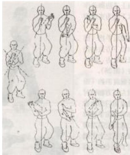
Figure 3 Chanting style