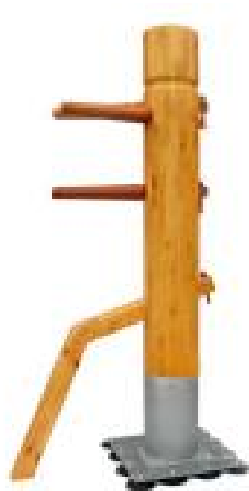
Figure 1 Wing Chun Mu Man Pile